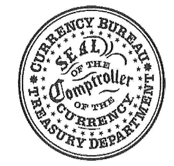
Acting Comptroller of the Currency

IN TESTIMONY WHEREOF, today, June 1, 2020, I have hereunto subscribed my name and caused my seal of office to be affixed to these presents at the U.S. Department of the Treasury, in the City of Washington, District of Columbia.