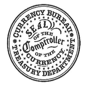
Acting Comptroller of the Currency

IN TESTIMONY WHEREOF, today, June 1, 2020, I have hereunto subscribed my name and caused my seal of office to be affixed to these presents at the U.S. Department of the Treasury, in the City of Washington, District of Columbia