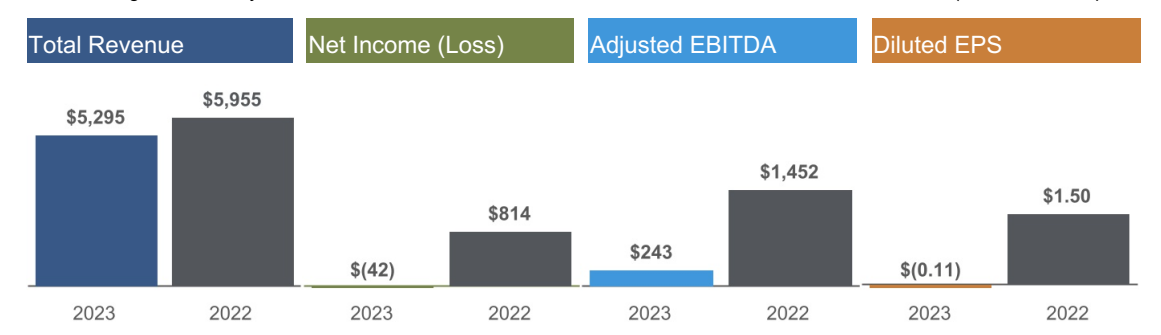
See "- Non-GAAP Financial Measures" below for a reconciliation of our Net income (loss) to Adjusted EBITDA.

The following is a summary of our consolidated results for the three months ended March 31, 2023 and 2022 (in millions, except for diluted EPS):